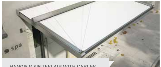
HANGING SINTESI AIR WITH CABLES