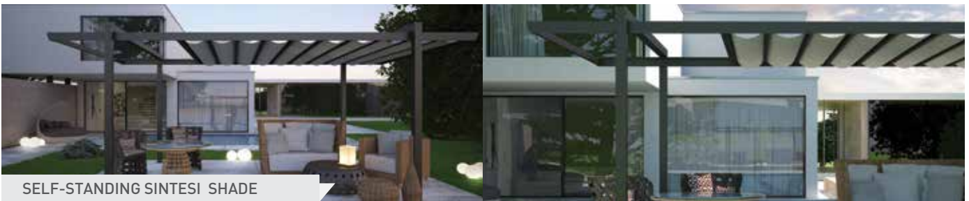
SELF-STANDING SINTESI SHADE WITH 1 OR 2 OPENINGS