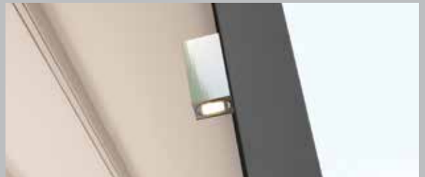
Bi-directional spot-lights on columns