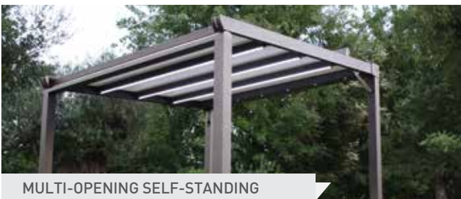
MULTI-OPENING SELF-STANDING SINTESI