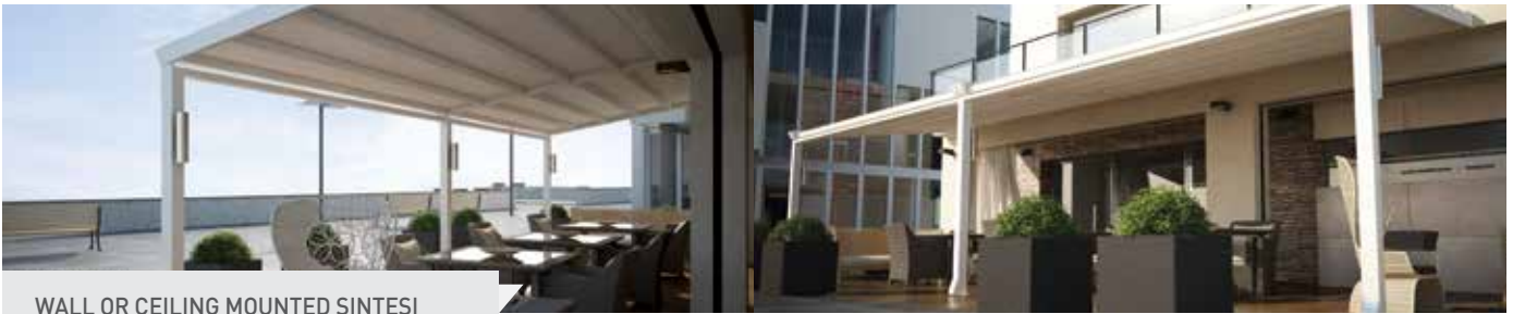
WALL OR CEILING MOUNTED SINTESI