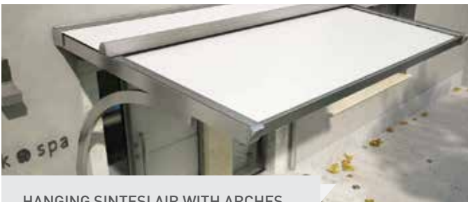
HANGING SINTESI AIR WITH ARCHES