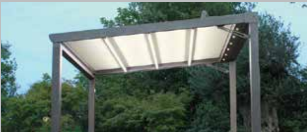
LEDs below the wind barriers and spotlights below the box.