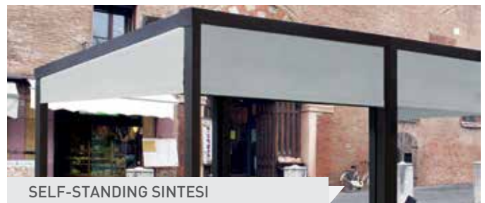
SELF-STANDING SINTESI CLOSE-UP VERSION