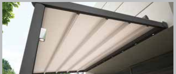
Optional profile colors matching with cover fabric